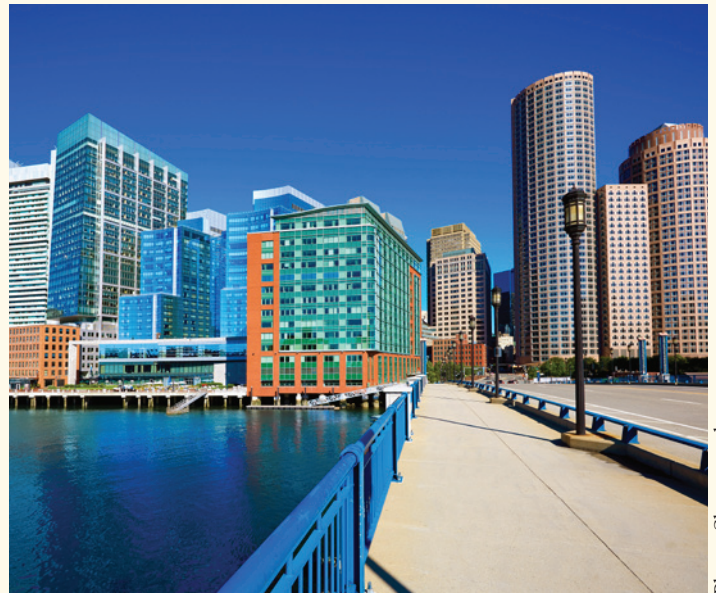
Boston’s skyline from Seaport Boulevard bridge.

“We are a very large firm, and for us to make a commitment to a market like Boston, we had to do it right in our minds. And in our minds, right was a big splash with a lot of strong lawyers and really hit