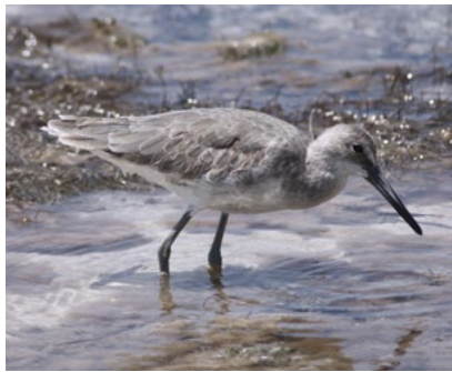
30 SUSTAINING THE PLANET