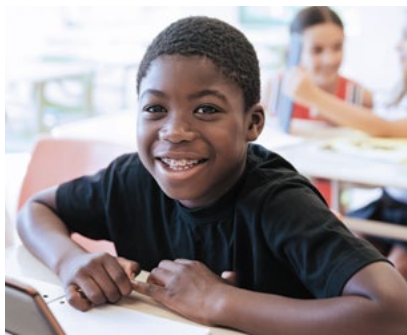
38 SUPPORTING CHILDREN + FAMILIES