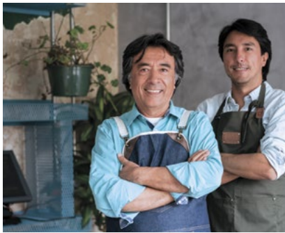
26 BUILDING COMMUNITIES