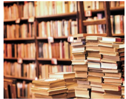
35 ON THE VANGUARD